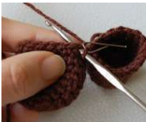
Image 19 - Merging branches

To join branches together, insert hook into first stitch after the sl st on branch A (Image 19) and make 1 sc in all 18 stitches. Insert hook back into branch B and work 1 sc in the last 9 stitches. (36)