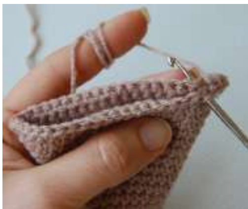
Image 16 - Sc through both thicknesses

Flatten opening closed and sc in next 22 stitches through both layers. (Image 16)