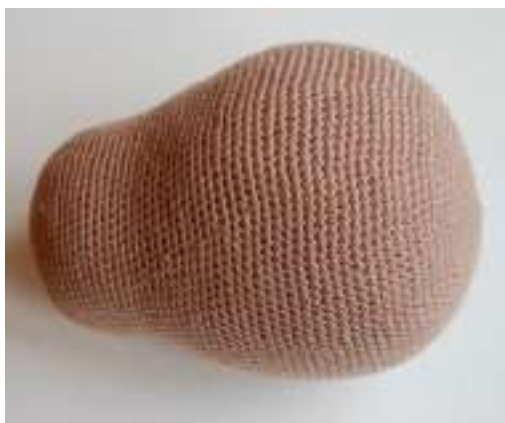
Image 8 - Finished head