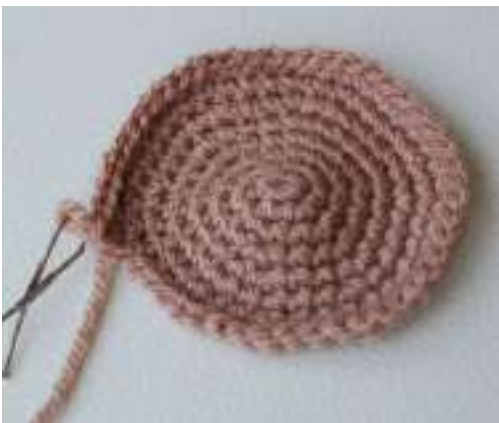
Image 2- Rnd 8 finished