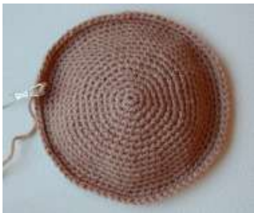
Image 3- Rnd 17 finished