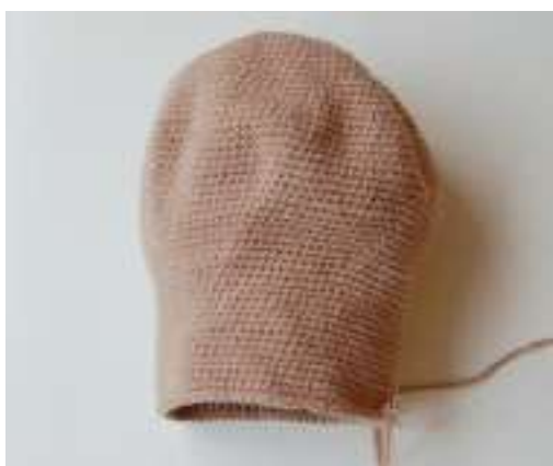
Image 5- Rnd 56 finished