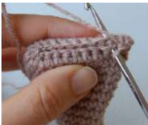
Image 17 - Sc through both thicknesses

Fasten off leaving tail long enough to sew ear to the head.