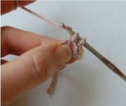
Image 1- Magic adjustable ring

Working from front of the head (muzzle) with magic adjustable ring and color A: